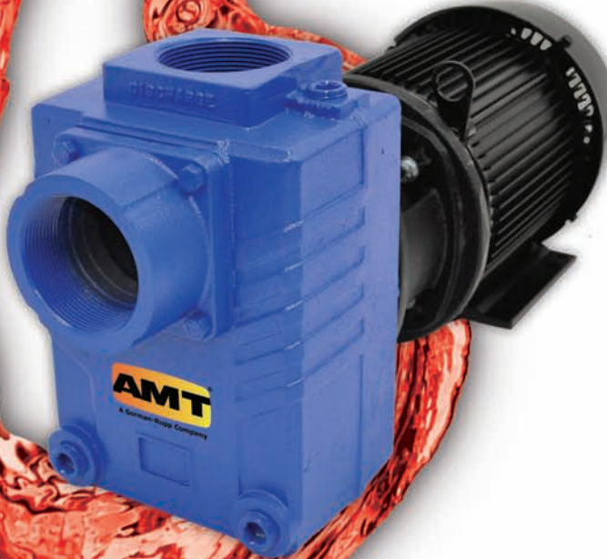
3" Self-Priming Pump